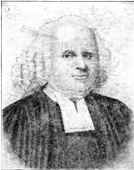
George Whitefield 1714—1770

NAZARENE PUBLISHING HOUSE, KANSAS CITY, MO.