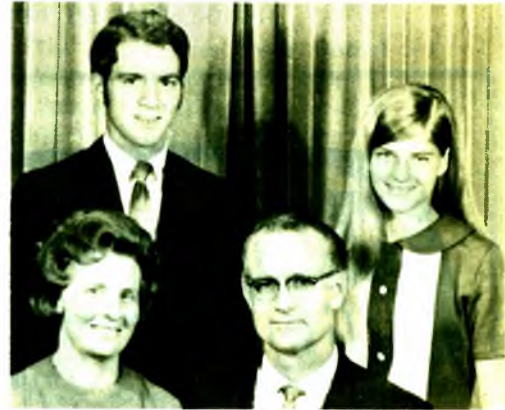
The Galloway family