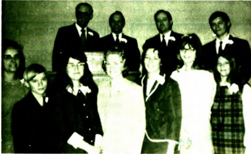
Charter members at the organizational service

Sunday revival. Attendance was up into the seventies in the week-night services.