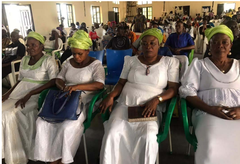
Mission and Ministry Camp.

This statement, shared in a recent seminar and prayer summit on the Nigeria Port Harcourt District, sounds a clear call that is being felt in Nigeria today. Nazarene Missions International (NMI) gathered to pray for the nations, for missionaries worldwide, and to disciple young adults, training them for ministry and short-or-long-term missions. They hosted a Young Adult Mission and Ministry Camp with more than 50 Nigerian young adults attending. For 48 hours those gathered shared new insights into forgiveness, intimacy with God, team unity, calling and commissioning to service.