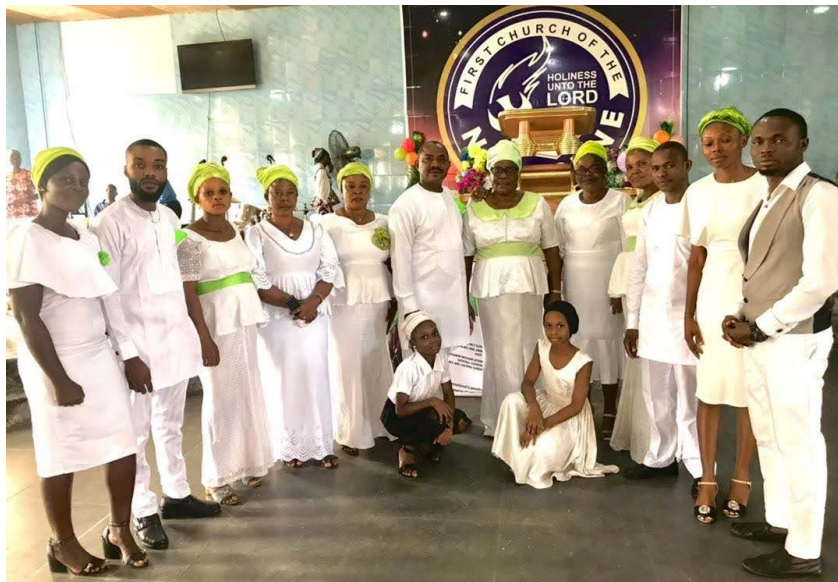
Mission Training Event.

In July, a Worship and Missions weekend event hosted intensive students, ministry leaders, pastors, and staff members. Over the three-day event, 90 young adults experienced an incredible time of spiritual deepening, with many sensing God's call to be the next wave of missionaries in the coming years. God is raising up a generation to go and serve a world much in need of His love and grace.