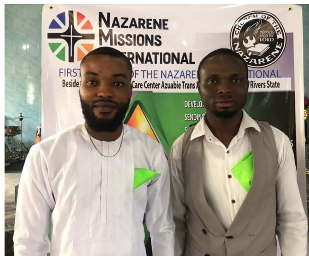
Young adults with a growing passion for missions.

In July, a Worship and Missions weekend event hosted intensive students, ministry leaders, pastors, and staff members. Over the three-day event, 90 young adults experienced an incredible time of spiritual deepening, with many sensing God's call to be the next wave of missionaries in the coming years. God is raising up a generation to go and serve a world much in need of His love and grace.