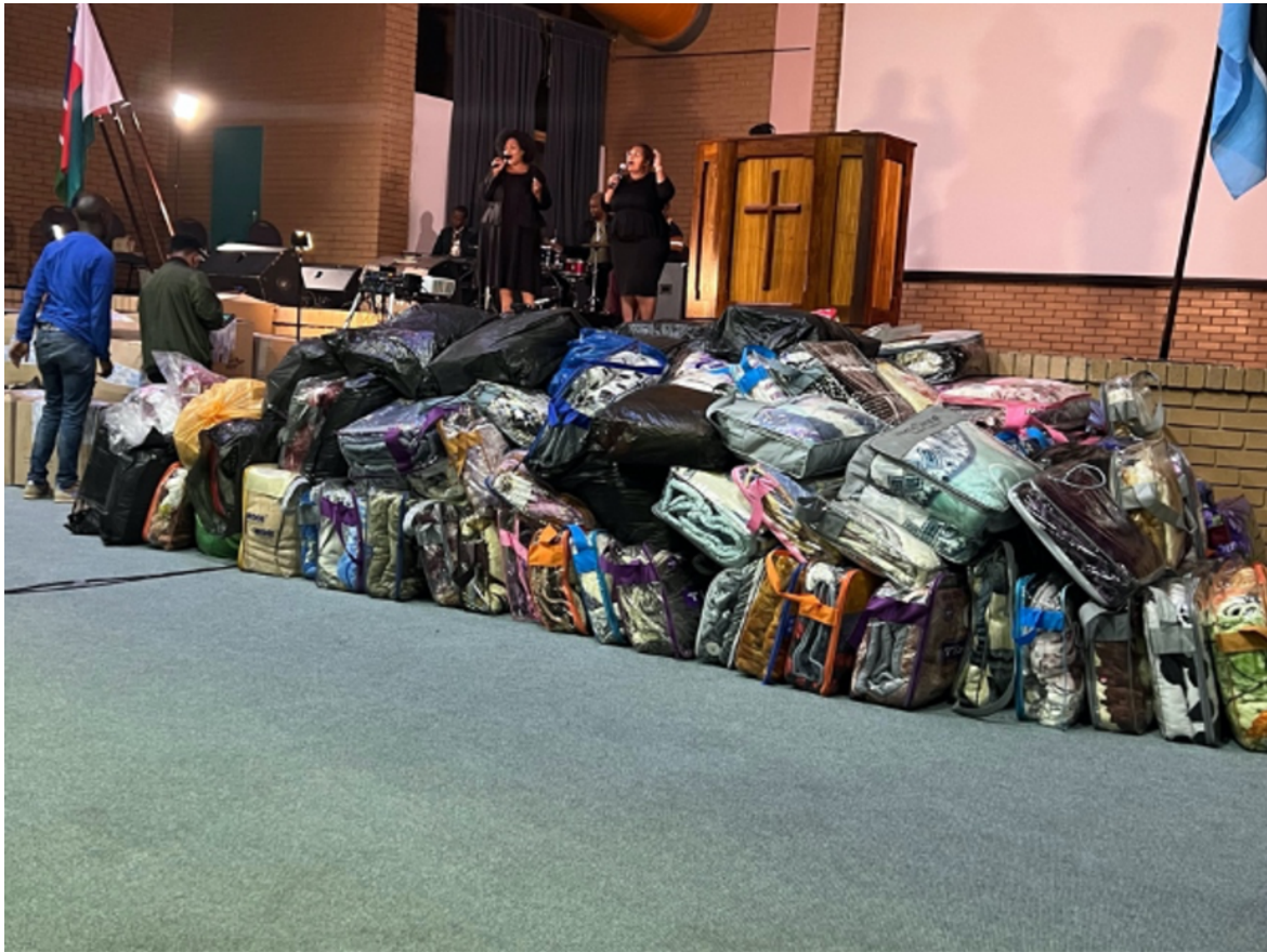
Donations for the displaced in KZN following the floods

Regardless of the many challenges faced in South Africa, the churches have found that the faithful practice of prayer and fasting can change everything. In January, churches of the Nazarene across the Africa South Field engaged in prayer and fasting for pastors, districts, fields, regions, the global church, evangelism efforts, discipleship initiatives, and Nazarene Theological College in South Africa.