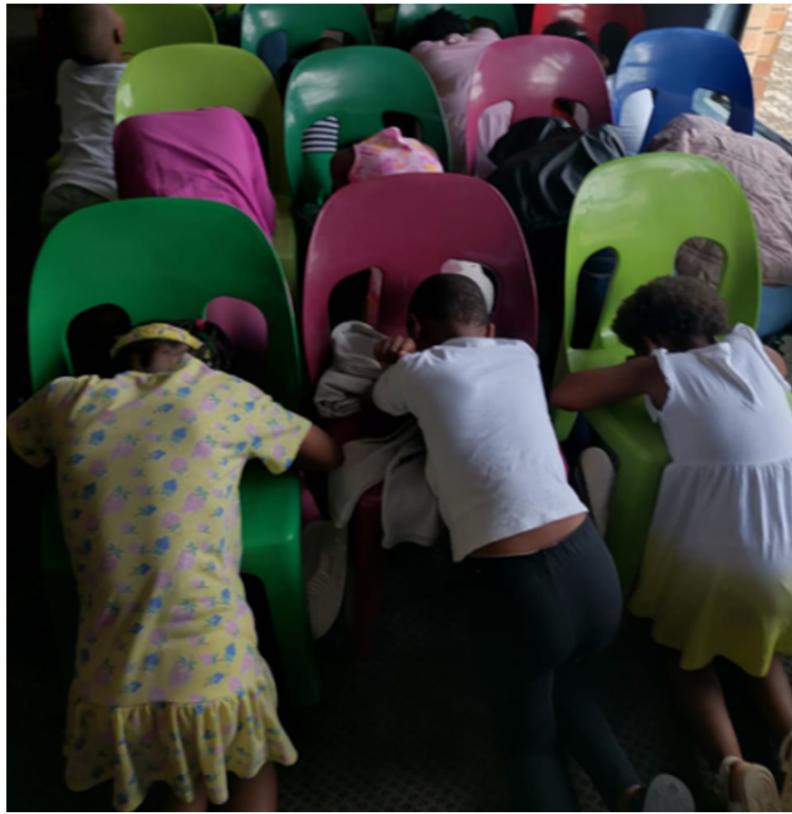
(Children prayed and fasted for over three hours in the Thulamahashe Church of the Nazarene.)

The scriptures encourage the people of God to faithfully give of themselves and their resources to support the work of God, joyfully joining Him in His mission to ALL. In South Africa, and across the Africa South Field, Nazarenes are faithfully tithing and supporting the work of the Church of the Nazarene at both the local and global levels. This giving helps the church to carry out the Great Commission, winning the lost for the Kingdom of God. By learning how to faithfully steward the resources God provides (however great or small), the people of God begin to see that God is the owner of all we have. World Evangelism giving is a top priority here. Having received so much over many years, the Church of the Nazarene in South Africa and on the Africa South Field is determined to do its part in seeing a continent and a world changed by God. He calls us to “break down the walls of dependency, raising people out of a ‘poverty mentality.’ By restoring trust, and raising the standard of giving and holy living, the church is realizing the beauty of unity in our African diversity, and by reclaiming our holiness heritage, and living it out faithfully, South Africa can be made new.”