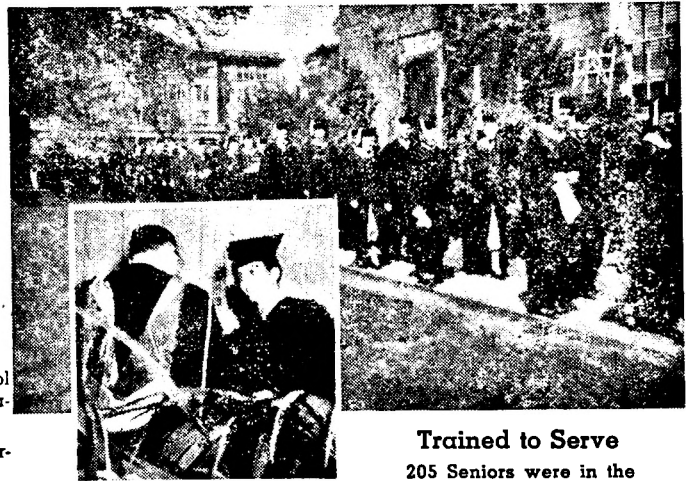
Trained to Serve 205 Seniors were in the graduating class this year.

September 9, 11, Sophomore and Upper- classmen Registration.