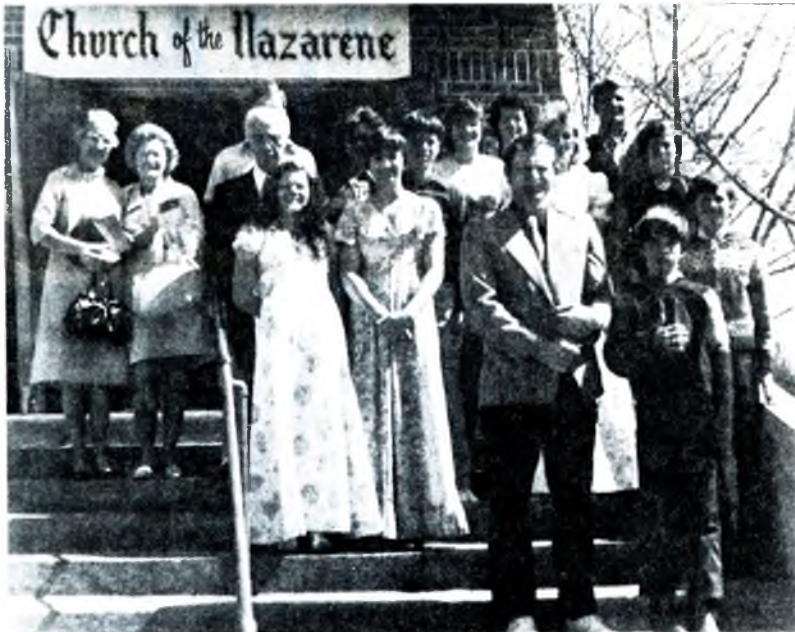
Participants in an Easter Bible "Readathon" began reading the Bible after the Easter Sunday evening service in the Red Bluff, Calif., church and continued 73 hours and 24 minutes. Twenty-three members and friends of the NYPS took part. Widespread local newspaper and radio coverage was given the event, and participants testified to personal values received.