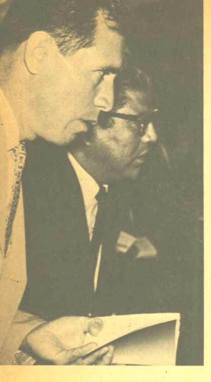
MEXICAN PASTORS join in singing during opening service.