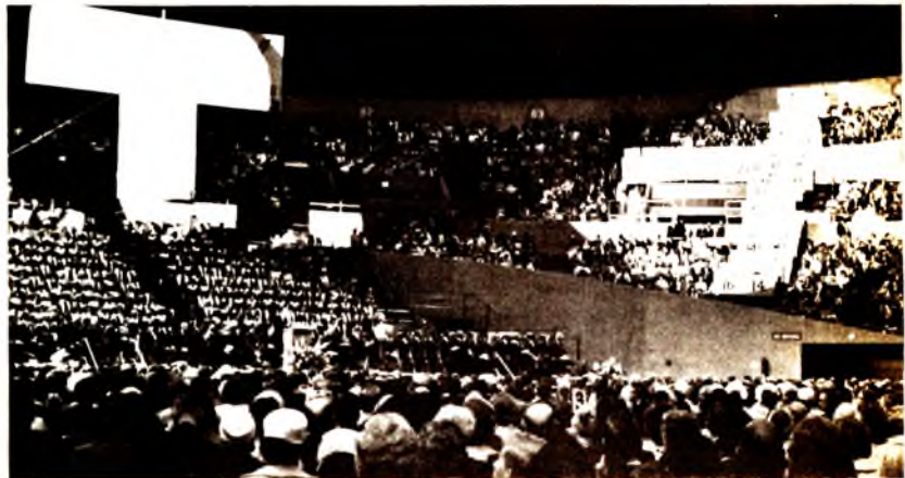
The Church Schools Convention rally on Saturday night presents the "March to a Million" goal.