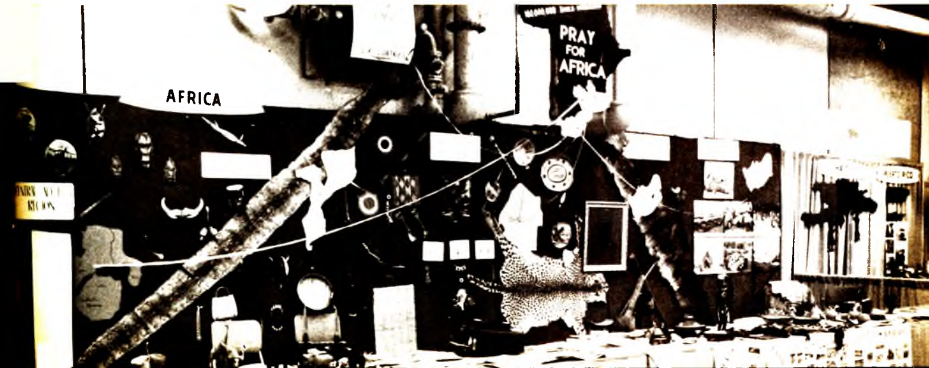
The colorful Africa booth in the Exhibit Hall presents the work of the Church of the Nazarene on the dark continent.