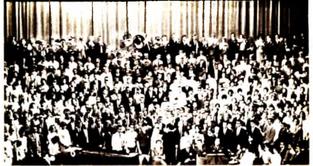
Part of the thousand-voice teen-age choir Friday night at the N.Y.P.S. Convention.